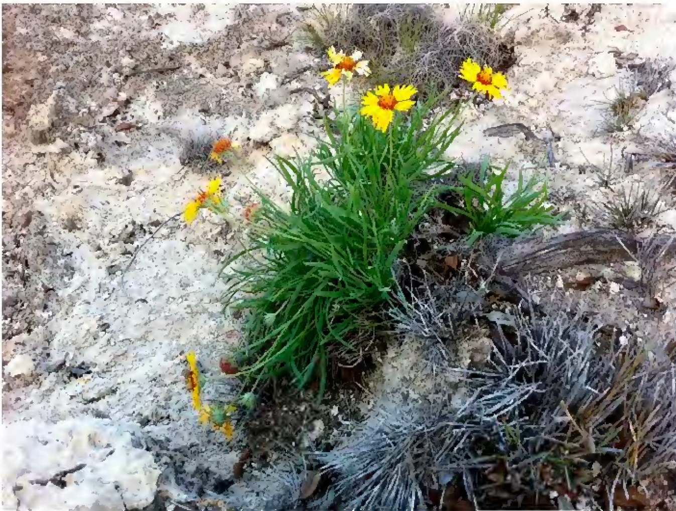
Fig. 3. Gaillardia c. mikemoorei in the field.